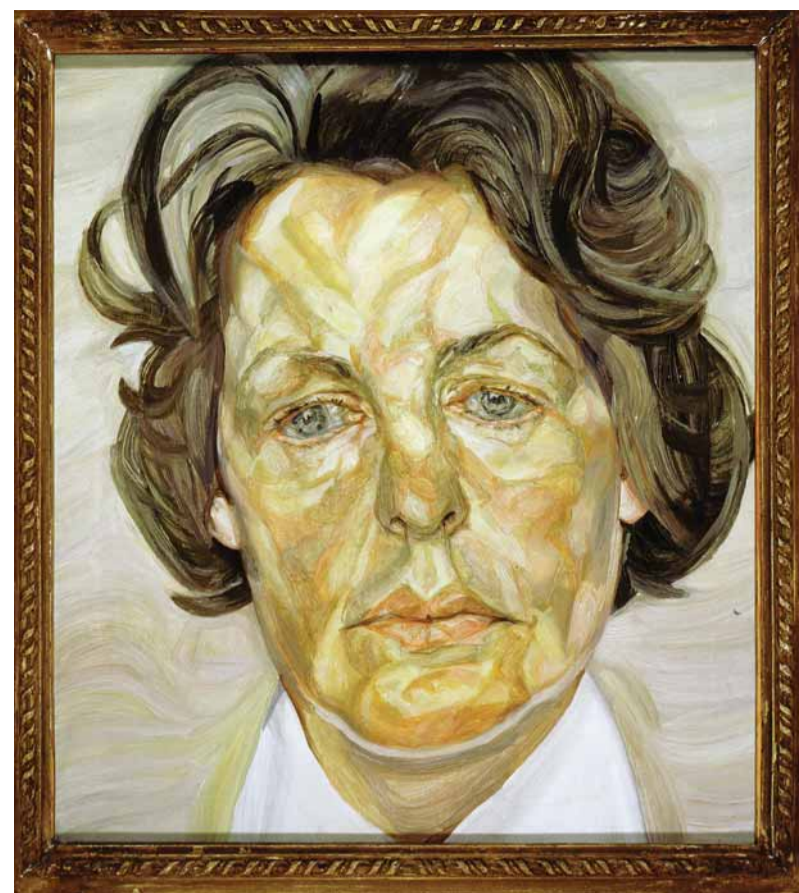
Painting of the Dowager Duchess of Devonshire “Woman in a White Shirt” 1954 by Lucian Freud

The extensive parkland and woodland is open all year for the benefit of all to enjoy country walks, as is Chatsworth farm shop, whilst the House re-opens on 14th March 2010.