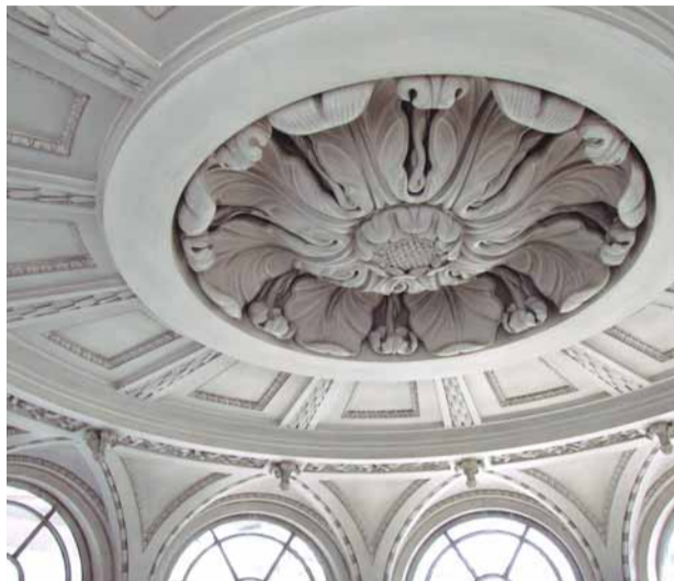
“Detail of a Victorian roof lantern, revealed for the first time in 100 years, above the restored Oak Stairs.”

Highlights of the 2010 displays will include a spectacular array of family portraits spanning 450 years, works of art commissioned by Duchess Georgiana, rare treasures including diamonds and jewels and an intriguing selection of 20th century paintings, including family portraits by Lucian Freud.